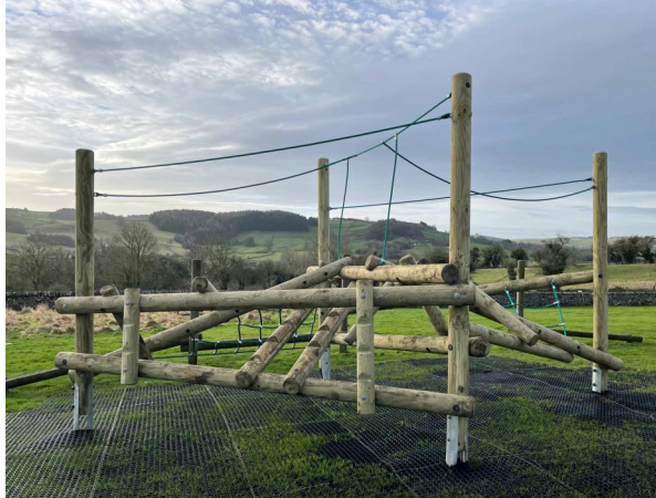
The new 'climbing frame' on the playing field.

At first I was dismayed as a much larger, but similar looking item had been installed in Chatsworth Adventure Playground which was impossible to play on as the poles were too big to grasp and too slippery to walk on. Undeterred we walked over to investigate and there we stayed.... There are cut-out footholds, serrated walkways, nets to climb and overhead ropes to hold. It's a fantastic piece of equipment that will build upper and lower body strength, confidence, balance and is great fun. Well done to the Parish Council for this find!