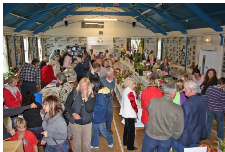
Previously Youlgrave Shows were popular, fun and colourful!