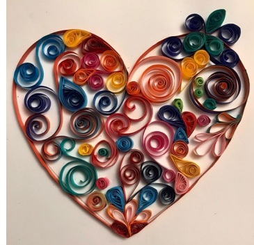
The skill of a keen quiller.