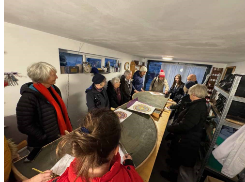
Above: the Well Dressing Committee consider the format and design; and (below) the plasticine-coated Board being assembled.

So after discussing with all the designers the idea how to go about doing a Winter Well Dressing, the ideas