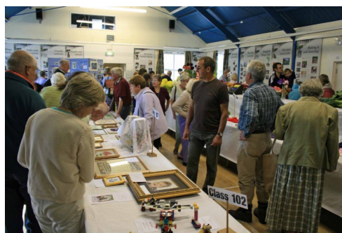
Youlgrave Show in 2010.