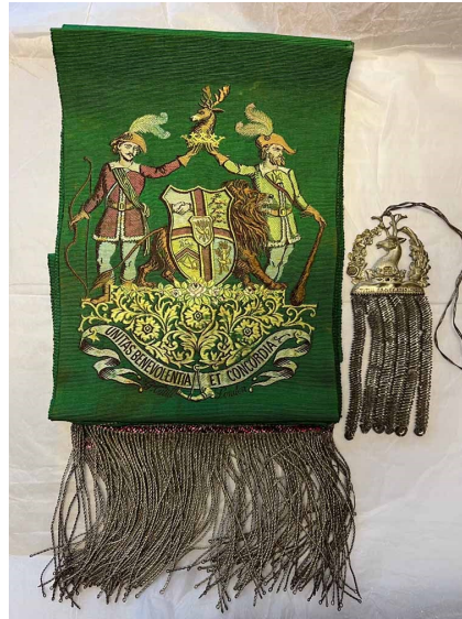
The Foresters Club Sash worn by members parading at Youlgrave.

A year today we would be dressing it again and we might win first prize then. It would be Midsummer Day!