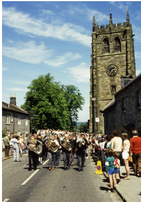
21st June 1986: Youlgrave Band marching along Church Street for the Well Dressing parade.

This year's mid-summer welldressing will explore themes of the natural world again, climate change, the threats to bees, our village's precious water supply, the village's Pommie Pilgrimage and its Labyrinth, and inequality in society.