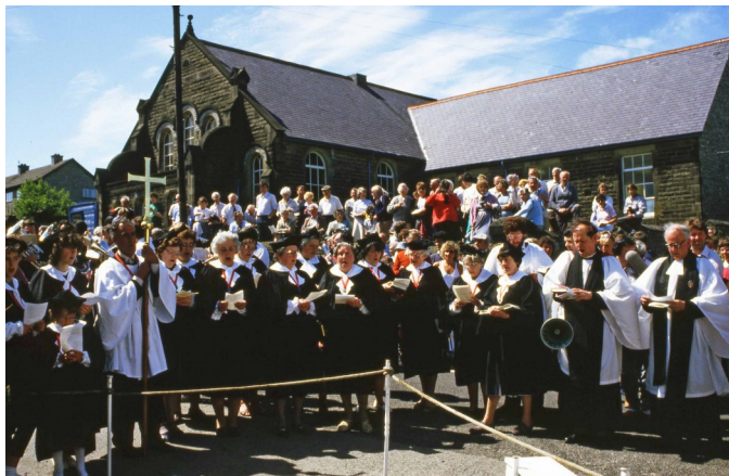
Left: The Church Choir in full voice as Bank Top Well is blessed during Youlgrave Welldressing, 21st June 1986.