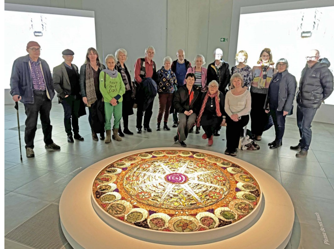
Above: Youlgrave's welldressing team with their acclaimed 'winter' design in Sheffield.