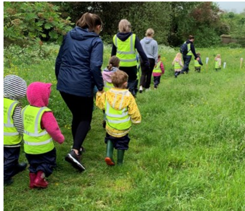
Children from Youlgrave Pre School and Primary School walked the Labyrinth.

In our Labyrinth, newly mown We'll walk together Friends with strangers, or alone In Youlgrave weather! We'll walk in joy and peace, Each turn our prayer increase. God's love will never cease For Pommie Pilgrims.