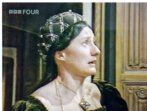
Maggie in the 1970 BBC TV drama 'The Six Wives of Henry VIII'.

Something has to be done about second homes, in particular, as well as holiday lets, or the village will die. It's time we thought about quotas.