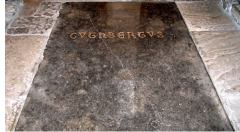
St Cuthbert's shrine in Durham Cathedral.