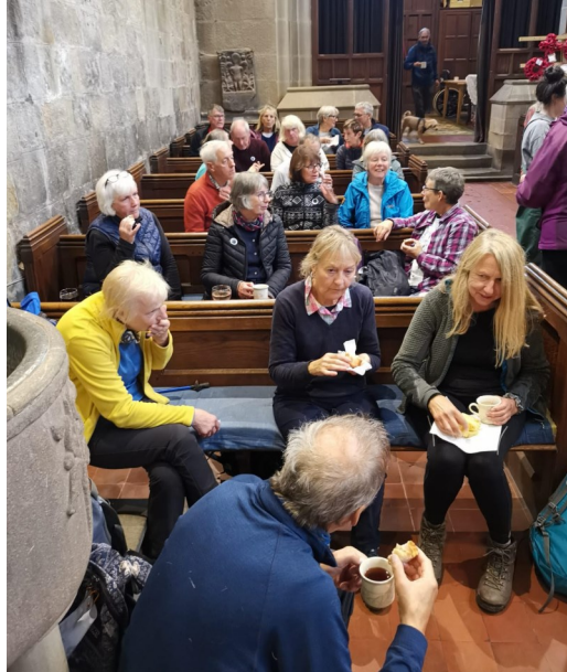
Post pilgrimage refreshments