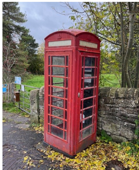
The familiar red phone box at the top of Holywell Lane.

Youlgrave's K6 phone box, an iconic design by Sir Giles Gilbert Scott dating from 1935, is Grade II listed and referenced in the Peak District National Park Authority's Youlgrave Conservation Area Appraisal (2010).