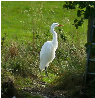
Great White Egret by the New Dam.

My commonest mammal sighting has been the grey squirrel which keeps raiding our feeders. Much more interesting have been hedgehogs both in our garden and elsewhere in the village. A much larger mammal was a deer in the Dale below Middleton. This was probably a roe buck. It was barking and would make a pleasant change from our usual black fallow.